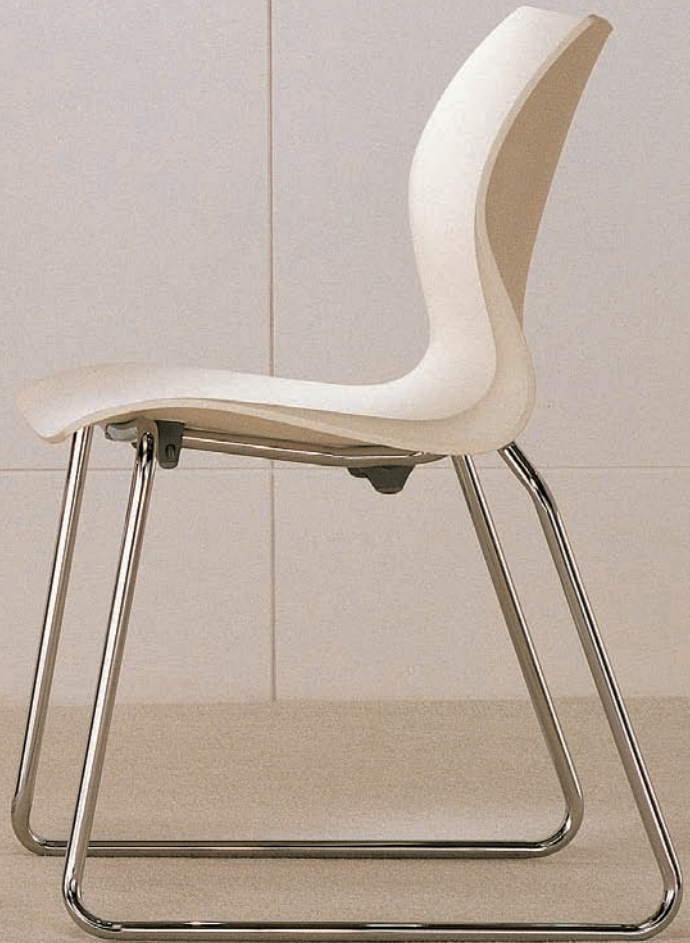
^ MODEL: Stacking Chair with No Arms SHELL: Fearless Red FRAME: Chrome