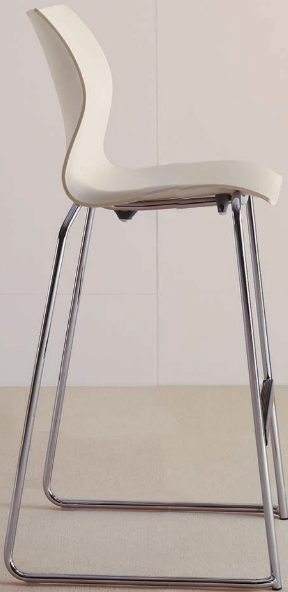
^ MODEL: Bar Stool with No Arms SHELL: Storm White FRAME: Chrome