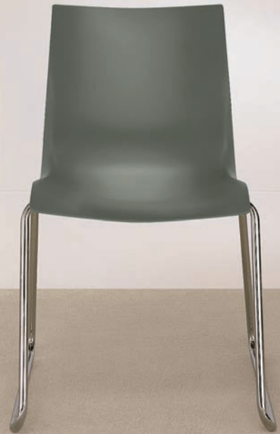
^ MODEL: Stacking Chairs with No Arms SHELL: Lunar Grey FRAME: Chrome