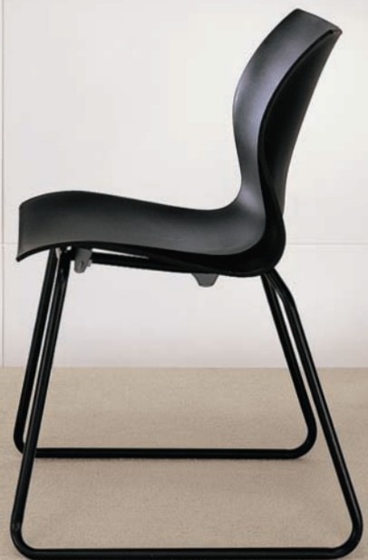
v MODEL: Stacking Chairs with No Arms SHELL: Ebony FRAME: Ebony